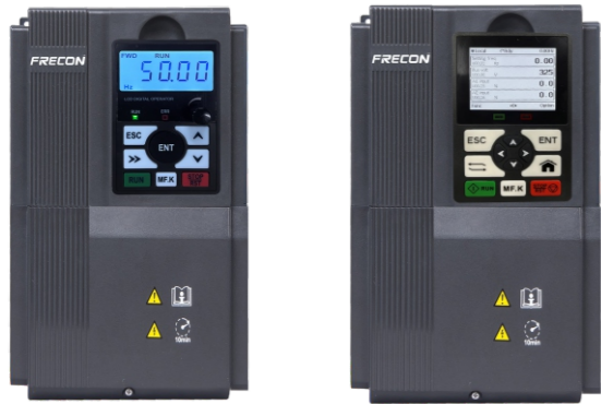
Simple LCD Keyboard